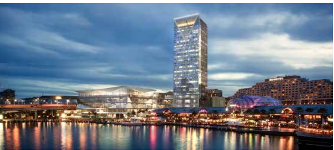
The ICC Sydney Convention Centre at left, with new Sofitel hotel tower between the centre and the Novotel hotel.